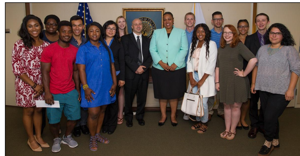
Image above: Our young leaders at the U.S. Department of Education in Washington, DC.